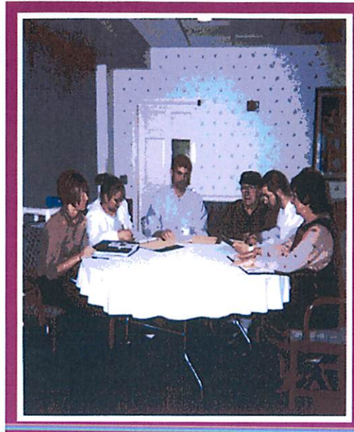
(Care Plan Team)